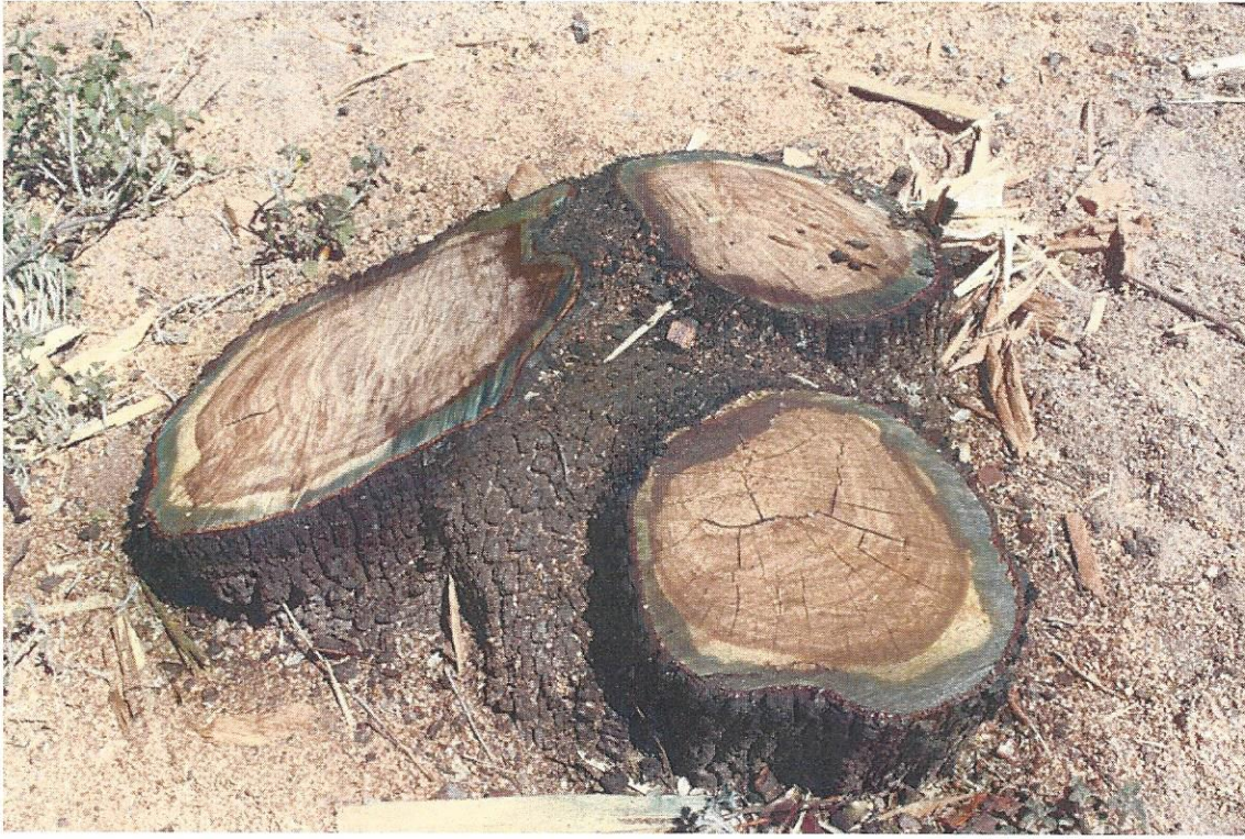
Upper Burro Cienaga Watershed Restoration Project Part 2. Cut and treated large alligator juniper stump.