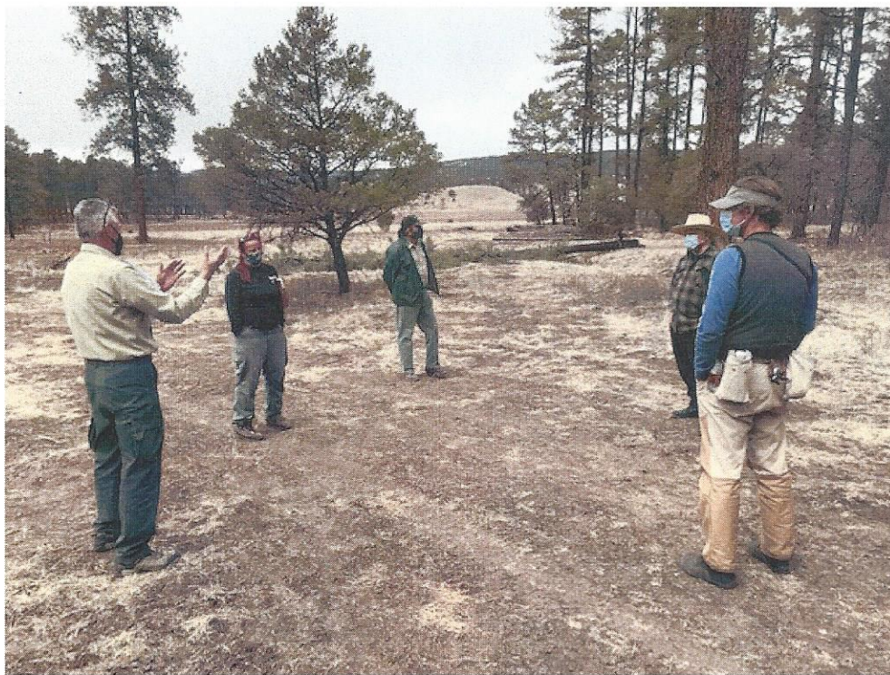
CFRP PROJECT: Field trip to one of the project sites to discuss thinning prescription. Agencies represented: USFS, Center for Biological Diversity and NM State Forestry