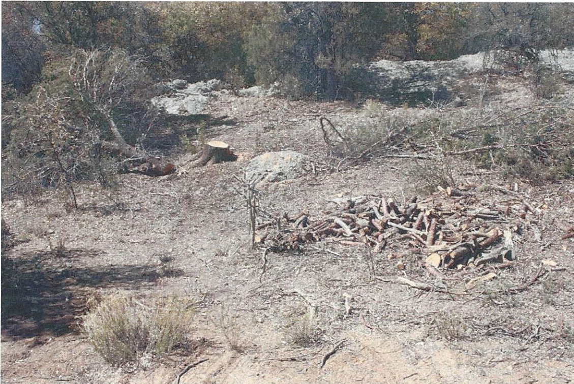
Upper Burro Cienaga Watershed Restoration Project Part 2. Cut alligator juniper stump and firewood.