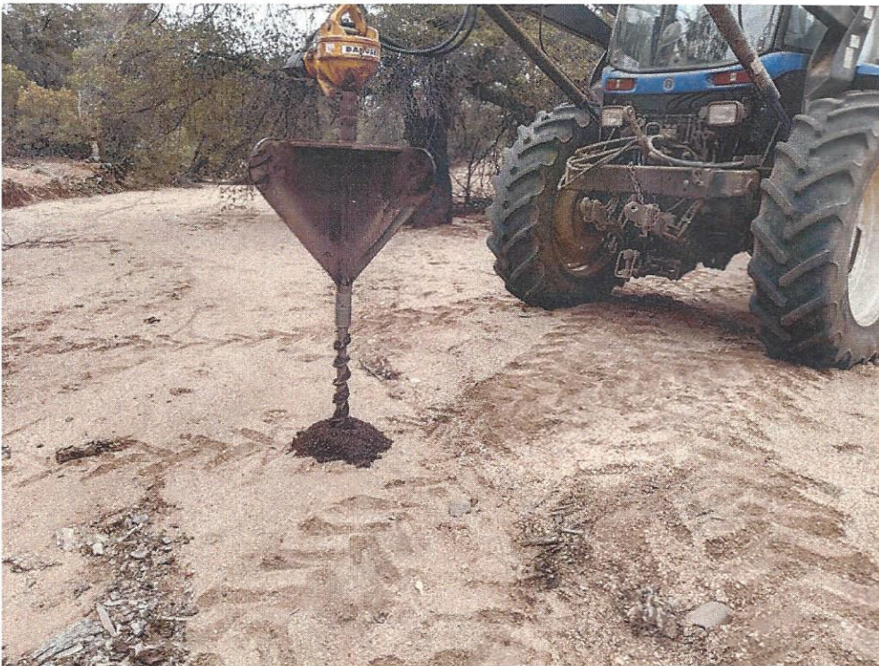
Upper Burro Cienaga Watershed Restoration Project Part 2. Tractor and auger drill hole for deep pole planting.