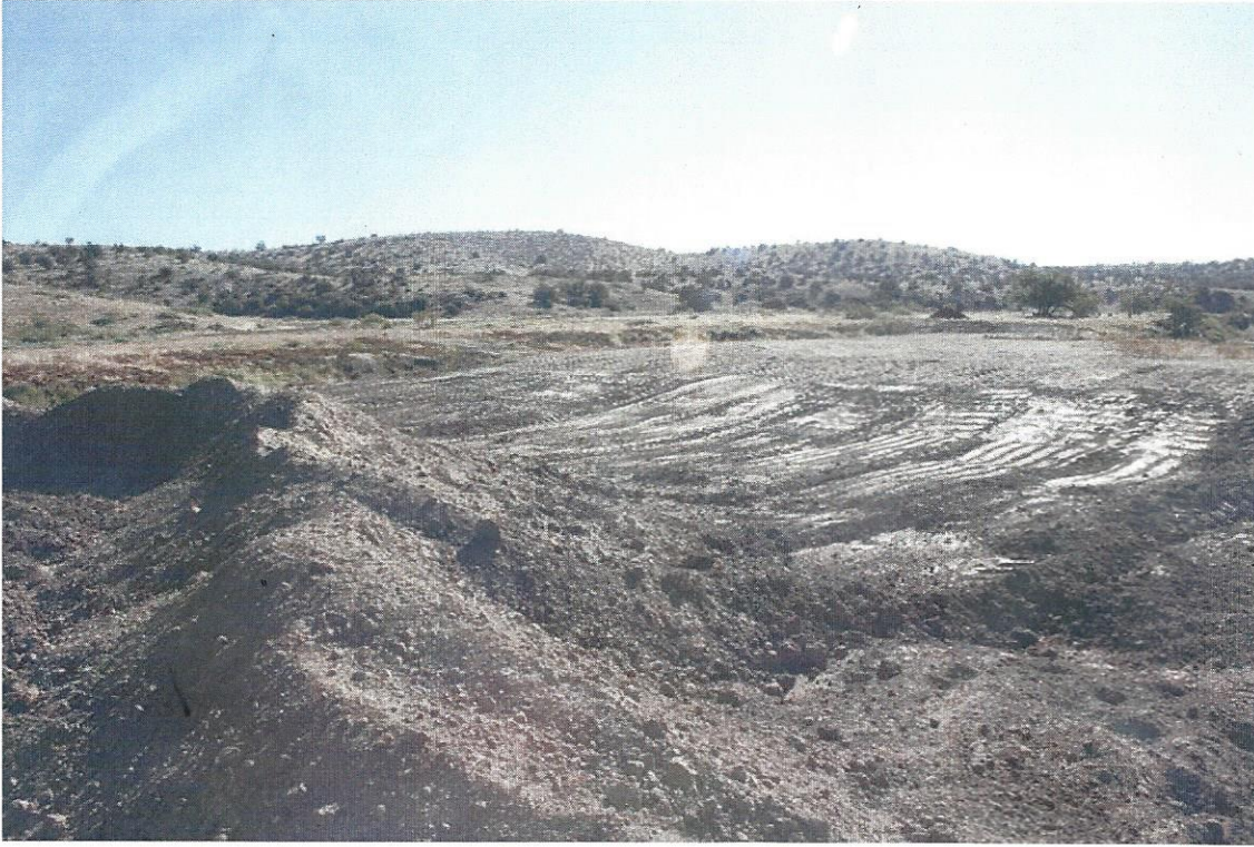
Upper Burro Cienaga Watershed Restoration Project Part 2. Rebuilt spillway on earthen watershed structure.