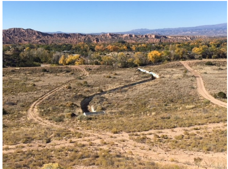
Santa Cruz Flood Control Structures