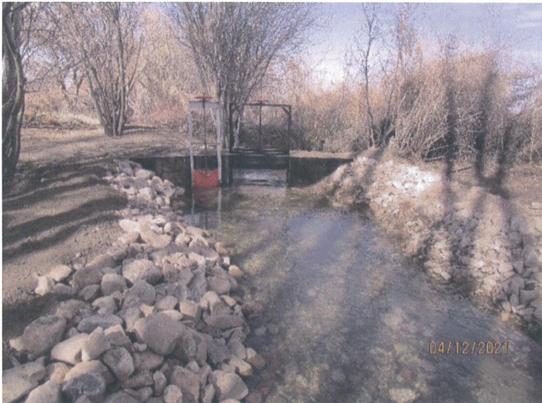
Des Montes Ditch grade control/diversion structure – Arroyo Seco, NM