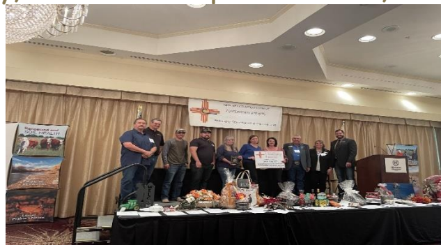
Taos SWCD, Outstanding District