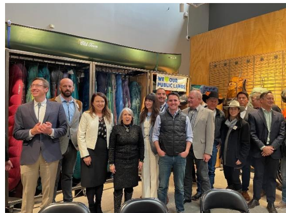
Signing Ceremony for Legacy Funds