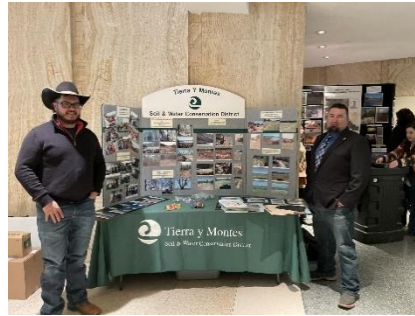
Tierra Y Montes