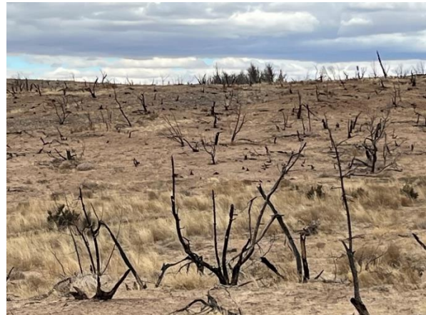
Work on Chupadera Mesa with State Land Office