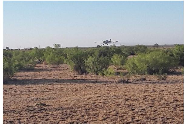
Mesquite Spraying for the Canadian River RCPP